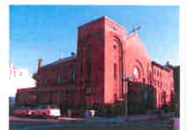
St. Peter Claver Church 29 Claver Place Brooklyn, NY 11238

Mass Schedule Sun.: 7: 30 AM & 10: 15 AM Mon. to Fri.: 8 AM (in St. Anthony's Chapel)