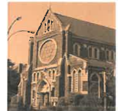
Our Lady of Victory Church 583 Throop Avenue Brooklyn, NY 11216

Mass Schedule Sundays: 9 AM Tuesdays: 11 AM