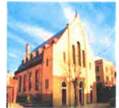
Holy Rosary Church 139 Chauncey Street Brooklyn, NY 11233

Mass Schedule Sundays: 9 AM Tuesdays: 11 AM