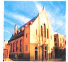
Holy Rosary Church 139 Chauncey Street Brooklyn, NY 11233

Mass Schedule Sundays: 9 AM Tuesdays: 11 AM