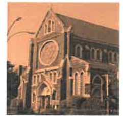
Our Lady of Victory Church 583 Throop Avenue Brooklyn, NY 11216

Mass Schedule Sundays: 9 AM Tuesdays: 11 AM