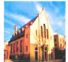
Holy Rosary Church 139 Chauncey Street Brooklyn, NY 11233

Mass Schedule Sundays: 9 AM Tuesdays: 11 AM