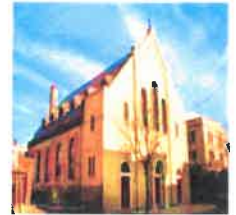
Holy Rosary Church 139 Chauncey Street Brooklyn, NY 11233

Mass Schedule Sundays: 9 AM Tuesdays: 11 AM