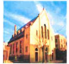
Holy Rosary Church 139 Chauncey Street Brooklyn, NY 11233

Mass Schedule Sundays: 9 AM Tuesdays: 11 AM