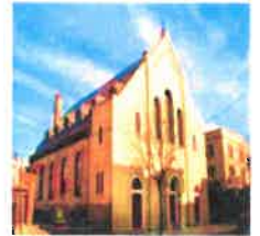
Holy Rosary Church 139 Chauncey Street Brooklyn, NY 11233

Mass Schedule Sundays: 9 AM Tuesdays: 11 AM