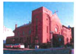
St. Peter Claver Church 29 Claver Place Brooklyn, NY 11238

Mass Schedule Sun.: 7: 30 AM & 10: 15 AM Mon. to Fri.: 8 AM (in St. Anthony's Chapel)