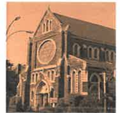
Our Lady of Victory Church 583 Throop Avenue Brooklyn, NY 11216

Mass Schedule Sundays: 9 AM Tuesdays: 11 AM