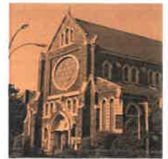
Our Lady of Victory Church 583 Throop Avenue Brooklyn, NY 11216

Mass Schedule Sundays: 9 AM Tuesdays: 11 AM