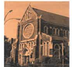
Our Lady of Victory Church 583 Throop Avenue Brooklyn, NY 11216

Mass Schedule Sundays: 9 AM Tuesdays: 11 AM