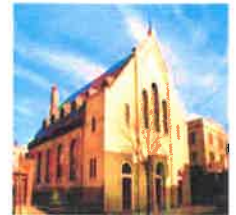
Holy Rosary Church 139 Chauncey Street Brooklyn, NY 11233

Mass Schedule Sundays: 9 AM Tuesdays: 11 AM