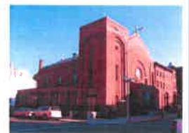
St. Peter Claver Church 29 Claver Place Brooklyn, NY 11238

Mass Schedule Sun.: 7: 30 AM & 10: 15 AM Mon. to Fri.: 8 AM (in St. Anthony's Chapel)