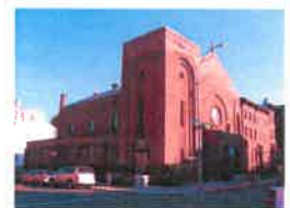
St. Peter Claver Church 29 Claver Place Brooklyn, NY 11238

Mass Schedule Sun.: 7: 30 AM & 10: 15 AM Mon. to Fri.: 8 AM (in St. Anthony's Chapel)