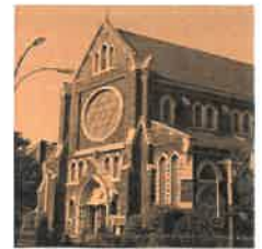
Our Lady of Victory Church 583 Throop Avenue Brooklyn, NY 11216

Mass Schedule Sundays: 9 AM Tuesdays: 11 AM