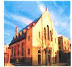
Holy Rosary Church 139 Chauncey Street Brooklyn, NY 11233

Mass Schedule Sundays: 9 AM Tuesdays: 11 AM