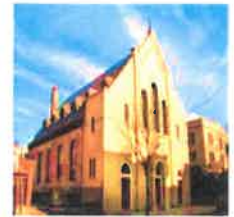
Holy Rosary Church 139 Chauncey Street Brooklyn, NY 11233

Mass Schedule Sundays: 9 AM Tuesdays: 11 AM