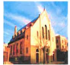
Holy Rosary Church 139 Chauncey Street Brooklyn, NY 11233

Mass Schedule Sundays: 9 AM Tuesdays: 11 AM