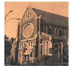
Our Lady of Victory Church 583 Throop Avenue Brooklyn, NY 11216

Mass Schedule Sundays: 9 AM Tuesdays: 11 AM