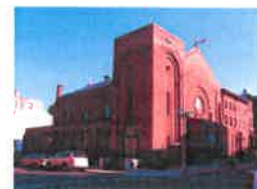
St. Peter Claver Church 29 Claver Place Brooklyn, NY 11238

Mass Schedule Sun.: 7: 30 AM & 10: 15 AM Mon. to Fri.: 8 AM (in St. Anthony's Chapel)