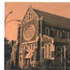
Our Lady of Victory Church 583 Throop Avenue Brooklyn, NY 11216

Mass Schedule Sundays: 9 AM Tuesdays: 11 AM