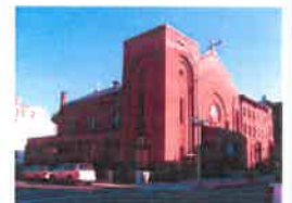
St. Peter Claver Church 29 Claver Place Brooklyn, NY 11238

Mass Schedule Sun.: 7: 30 AM & 10: 15 AM Mon. to Fri.: 8 AM (in St. Anthony's Chapel)