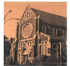
Our Lady of Victory Church 583 Throop Avenue Brooklyn, NY 11216

Mass Schedule Sundays: 9 AM Tuesdays: 11 AM