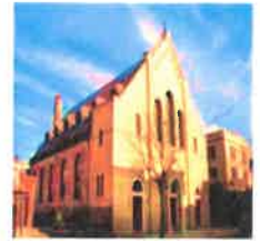
Holy Rosary Church 139 Chauncey Street Brooklyn, NY 11238

Mass Schedule Sundays: 9 AM Tuesdays: 11 AM