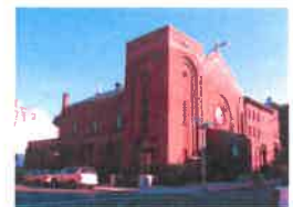
St. Peter Claver Church 29 Claver Place Brooklyn, NY 11238

Mass Schedule Sun.: 7: 30 AM & 10: 15 AM Mon. to Fri.: 8 AM (in St. Anthony's Chapel)