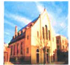
Holy Rosary Church 139 Chauncey Street Brooklyn, NY 11233

Mass Schedule Sundays: 9 AM Tuesdays: 11 AM