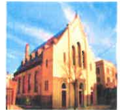
Holy Rosary Church 139 Chauncey Street Brooklyn, NY 11233

Mass Schedule Sundays: 9 AM Tuesdays: 11 AM