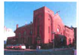
St. Peter Claver Church 29 Claver Place Brooklyn, NY 11238

Mass Schedule Sun.: 7: 30 AM & 10: 15 AM Mon. to Fri.: 8 AM (in St. Anthony's Chapel)