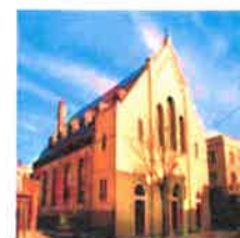
Holy Rosary Church 139 Chauncey Street Brooklyn, NY 11233

Mass Schedule Sundays: 9 AM Tuesdays: 11 AM