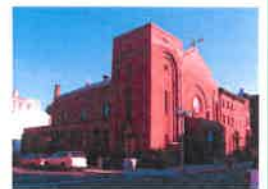
St. Peter Claver Church 29 Claver Place Brooklyn, NY 11238

Mass Schedule Sun.: 7: 30 AM & 10: 15 AM Mon. to Fri.: 8 AM (in St. Anthony's Chapel)