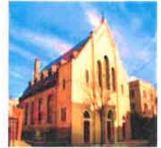
Holy Rosary Church 139 Chauncey Street Brooklyn, NY 11233

Mass Schedule Sundays: 9 AM Tuesdays: 11 AM