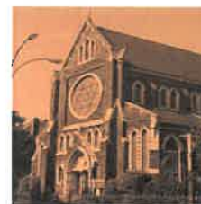
Our Lady of Victory Church 583 Throop Avenue Brooklyn, NY 11216

Mass Schedule Sundays: 9 AM Tuesdays: 11 AM