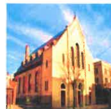
Holy Rosary Church 139 Chauncey Street Brooklyn, NY 11233

Mass Schedule Sundays: 9 AM Tuesdays: 11 AM