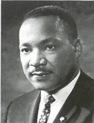
Rev. Dr. Martin Luther King, Jr. <Assassinated 1968 - ON KKK Hit List > Baptist