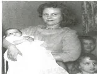
VIOLA LIUZZO ASSASSINATED 1965 CATHOLIC

MARTYRS FOR JUSTICE COMES IN ALL FAITHS & RACE WE WILL NEVER FORGET THEM & OTHERS – NEVER! NEVER ! THEY SACRIFICED THEIR LIVES FOR HUMAN RIGHTS