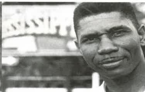
MEDGAR WYLIE EVERS ASSASSINATED 1963 BAPTIST

BECAUSE IT WAS THE AMERICAN & HUMAN THING TO DO ! THESE VOTER REGISTRATIN VOLUNTEERS WERE ASSASSINATED 1964