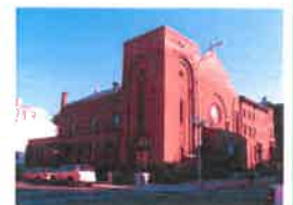
St. Peter Claver Church 29 Claver Place Brooklyn, NY 11238

Mass Schedule Sun.: 7: 30 AM & 10: 15 AM Mon. to Fri.: 8 AM (in St. Anthony's Chapel)