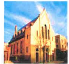
Holy Rosary Church 139 Chauncey Street Brooklyn, NY 11233

Mass Schedule Sundays: 9 AM Tuesdays: 11 AM