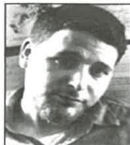
MICHAEL SCHWERNER JEWISH