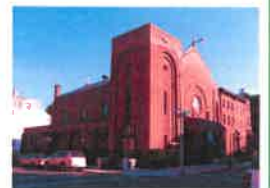
St. Peter Claver Church 29 Claver Place Brooklyn, NY 11238

Mass Schedule Sun.: 7: 30 AM & 10: 15 AM Mon. to Fri.: 8 AM (in St. Anthony's Chapel)