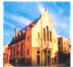
Holy Rosary Church 139 Chauncey Street Brooklyn, NY 11233

Mass Schedule Sundays: 9 AM Tuesdays: 11 AM