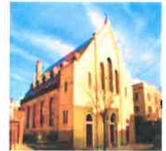
Holy Rosary Church 139 Chauncey Street Brooklyn, NY 11233

Mass Schedule Sundays: 9 AM Tuesdays: 11 AM