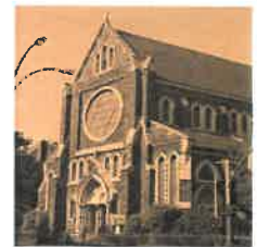
Our Lady of Victory Church 583 Throop Avenue Brooklyn, NY 11216

Mass Schedule Sundays: 9 AM Tuesdays: 11 AM