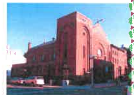
St. Peter Claver Church 29 Claver Place Brooklyn, NY 11238

Mass Schedule Sun.: 7: 30 AM & 10: 15 AM Mon. to Fri.: 8 AM (in St. Anthony's Chapel)