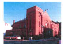
St. Peter Claver Church 29 Claver Place Brooklyn, NY 11238

Mass Schedule Sun.: 7: 30 AM & 10: 15 AM Mon. to Fri.: 8 AM (in St. Anthony's Chapel)