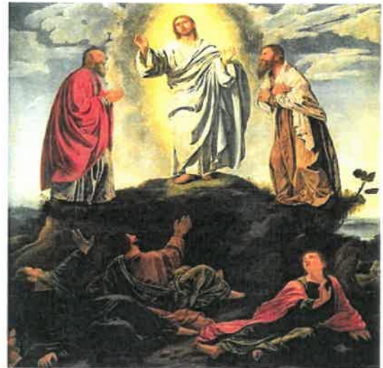
The Transfiguration of the Lord.