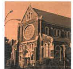
Our Lady of Victory Church 583 Throop Avenue Brooklyn, NY 11216

Mass Schedule Sundays: 9 AM Tuesdays: 11 AM