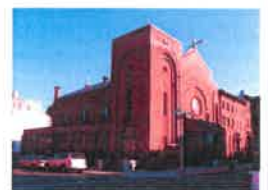
St. Peter Claver Church 29 Claver Place Brooklyn, NY 11238

Mass Schedule Sun.: 7: 30 AM & 10: 15 AM Mon. to Fri.: 8 AM (in St. Anthony's Chapel)