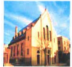
Holy Rosary Church 139 Chauncey Street Brooklyn, NY 11233

Mass Schedule Sundays: 9 AM Tuesdays: 11 AM