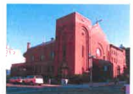
St. Peter Claver Church 29 Claver Place Brooklyn, NY 11238

Mass Schedule Sun.: 7: 30 AM & 10: 15 AM Mon. to Fri.: 8 AM (in St. Anthony's Chapel)